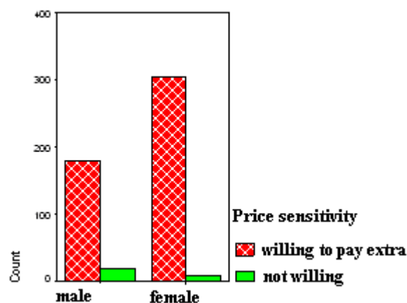
Figure 2 Price Sensitivity by Gender

There is a statistically verifiable correlation between the willingness to pay extra for environmentally friendly products and gender ( \chi^2 = 11,320 ; df = 1 ; p = 0,001 ). It can be stated that men are less willing to pay extra than women. (Figure 2)