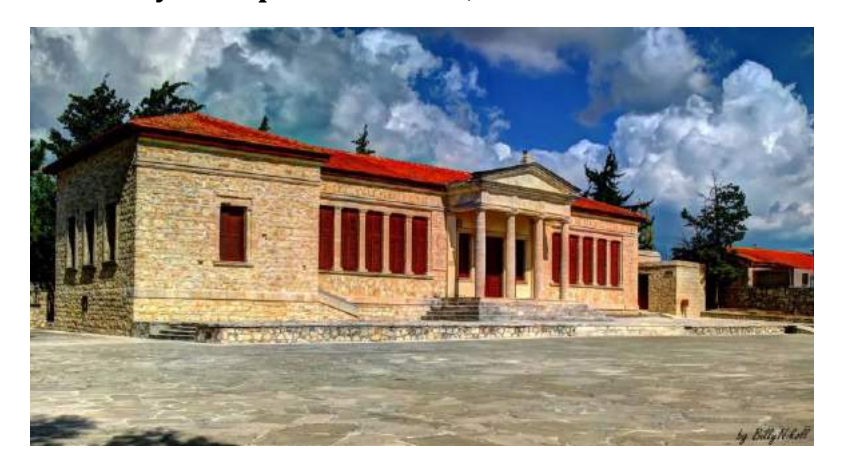
Thursday 26 September 2019, 19:00-22:30

Conference dinner in the village of Lofou, northwest of Limassol, at the courtyard of the old school of the village.